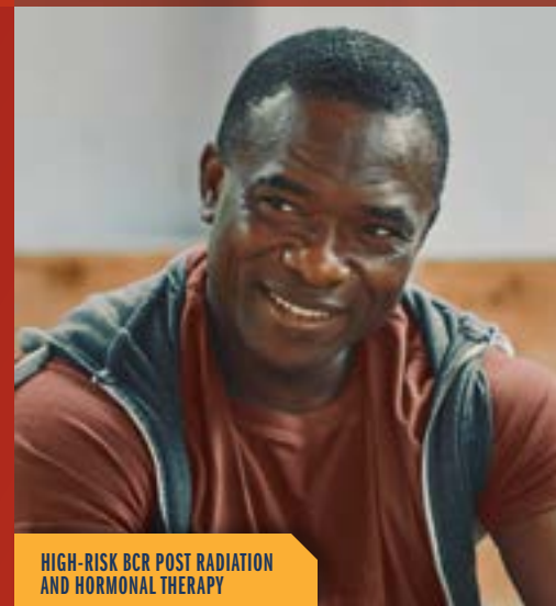
HIGH-RISK BCR POST RADIATION AND HORMONAL THERAPY

GnRH , gonadotropin-releasing hormone. Not actual patients or patient cases; content for illustrative purposes only.