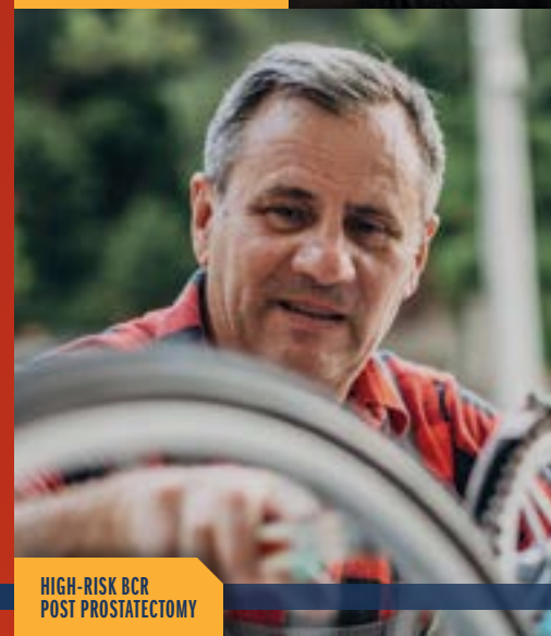
HIGH-RISK BCR POST PROSTATECTOMY