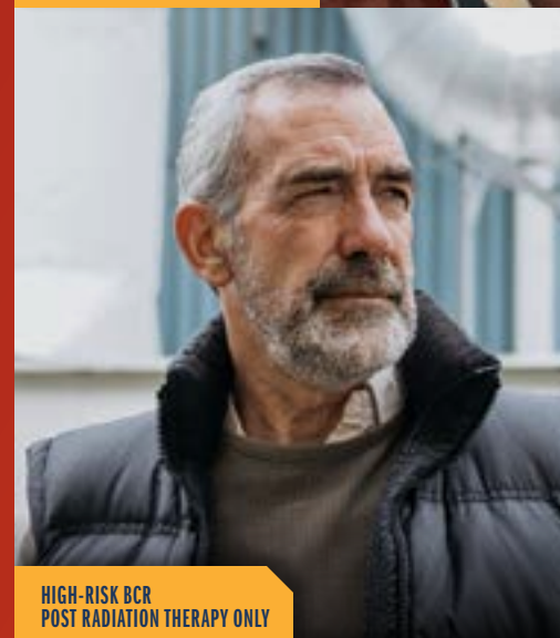
HIGH-RISK BCR POST RADIATION THERAPY ONLY